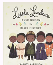
Bold Women in Black History Vashti Harrison

Learn more about some of the great women that shaped history by clicking on these read-alouds!